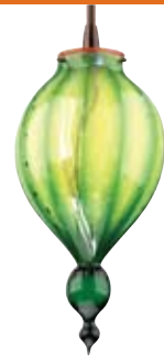
Art for light's sake