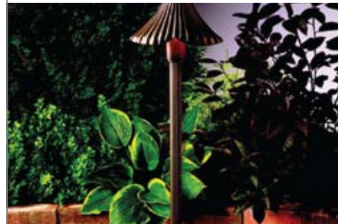
The garden path