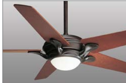
Grace and beauty